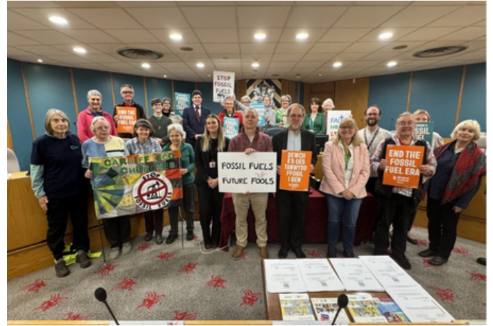
Members of Cardiff Eco churches connect at Cardiff council chambers